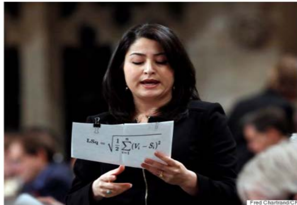
Maryam Monsef speaks in the House of Commons on Dec. 1, 2016.

(i) The Minister responsible for electoral reform in 2016 contemplates the Gallagher (1991) index of proportionality of votes and seats.