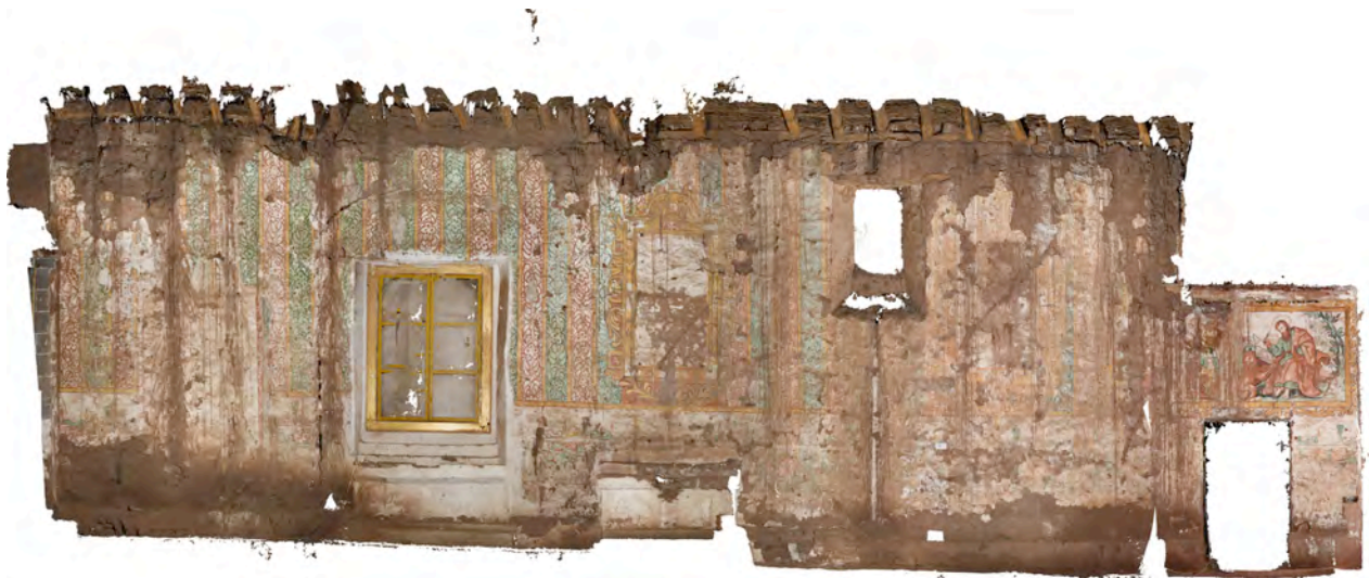
Figure 6. South façade, orthographic elevation of frescos generated from a photogrammetric model

The final ortho-image (Figure 6) can then be printed from a standard sheet in AutoCAD with the glossary and a titleblock containing relevant project information.