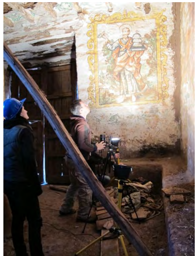
Figure 2. taking photograph using artificial lighting.

The controls were selected on sharp edges of the wall painting’s features to prevent the use of any targets that might damage the integrity of these important character-defining elements of this historic building.