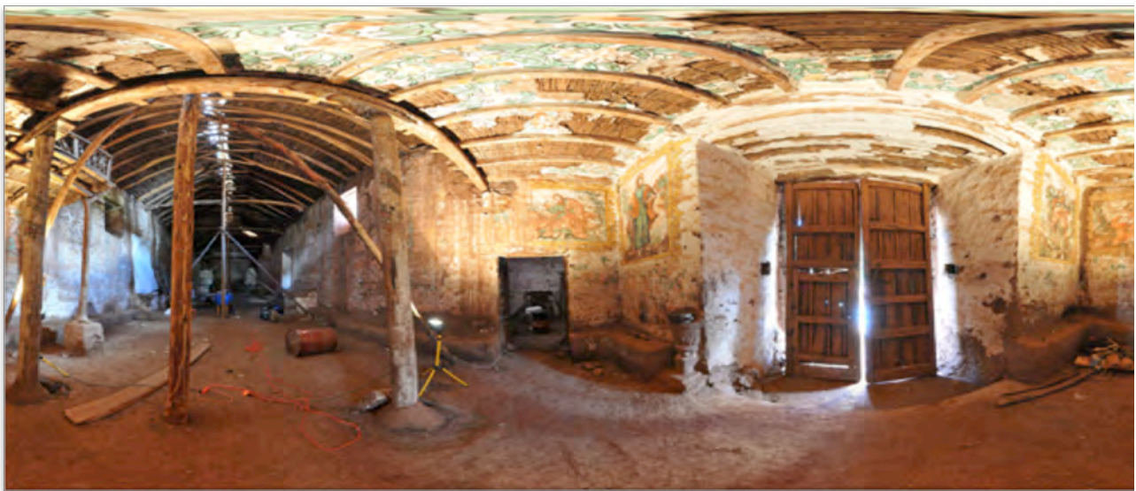
Figure 1. Panoramic spherical image of the interior of Kuño Tambo church, Peru

“Constructed with thick mud brick walls, buttresses over a