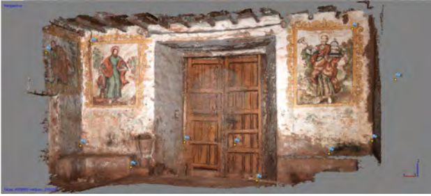
Figure 5. Final photogrammetric model of the east entrance with scaled survey points picked (blue flags) and texture applied

Finally, the orthographic models and textures of each elevation were imported into AutoCAD where they were scaled according to a survey which was carried out concurrently to the photos being captured on site. Matching the image to the survey was simply a matter of picking two specified points on the images (Figure 5), using the scale command in AutoCAD, and snapping the selected points on the image to the imported survey points.