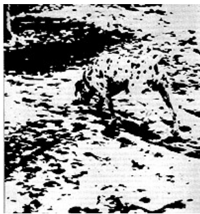
Figure 1: Spot the Dalmatian!

theory offers no way of accounting for this, as on this view perceptual grouping is largely determined by stimulus properties. Palmer (1999) and Pomerantz and Kubovy (1986) have pointed out further problems for the Gestalt view. First, the Gestalt principles don't distinguish between objects and groups of objects. Also, Gestalt principles ignore the role of top-down, general-purpose knowledge in perceptual organization. For instance, the Gestalt principles cannot explain why people who don't know that Figure 1 is a picture of a Dalmatian usually fail to see any meaningful pattern in the image, whereas people who are aware that the image represents a dog not only find the dog easily but also organize the stimulus so that otherwise indistinguishable black dots become a dog, a sidewalk, and the shade beneath a tree.