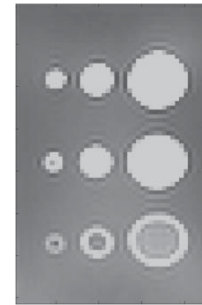
Figure 1: Phantom geometry (MR magnitude).

A custom gelatin phantom (10% gelatin, 1% NaCl) was constructed with three rows of circular wells with increasing diameters (5, 10, 15mm). Each series of wells was filled with saline solutions with increasing conductivities (~3, 5, 8 S/m). Cupric sulphate was added for MR contrast (Figure 1). Data was acquired on a Philips Achieva 3T platform, with a standard 3D SE sequence; phase images were used for reconstructing the conductivity. Two-dimensional reconstructions of the electric conductivity based on our inverse approach are presented in Figure 2.